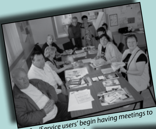
2002 – 'Service users' begin having meetings to promote 'involvement'.

Reflecting then on the history of PLUS since beginning in 2002, the following are photographs which illustrate important events in our journey. Do you remember these momentous occasions. Where you there yourself? What will the momentous occasions of the future be?!!