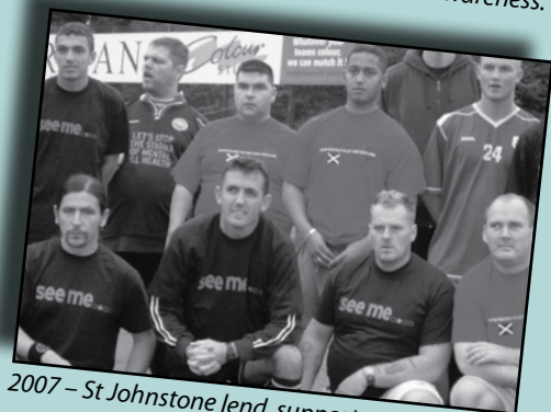
2007 – St Johnstone lend support to our campaigns.