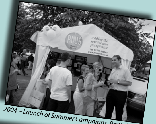
2004 – Launch of Summer Campaigns, Perth Show.