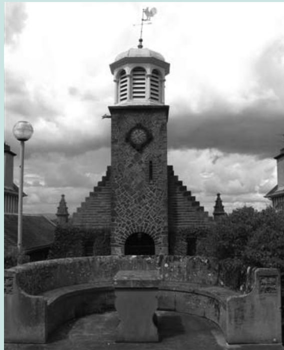
Murray Royal Chapel.

The Murray Royal Hospital has long been viewed as a treasured and important resource for the people of Perth. Opened in 1827, for the princely sum of £20,000. The then 'new' Scottish Royal Asylum was bequeathed by James Murray for the benefit of the people of Perth and surrounding districts. It appears to be the wish of many local people that the soon to be former hospital building and surrounding land continues to fulfil that original philanthropic purpose.