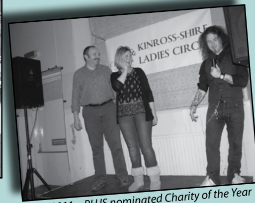
2010/2011 – PLUS nominated Charity of the Year for the Kinross Ladies Circle.