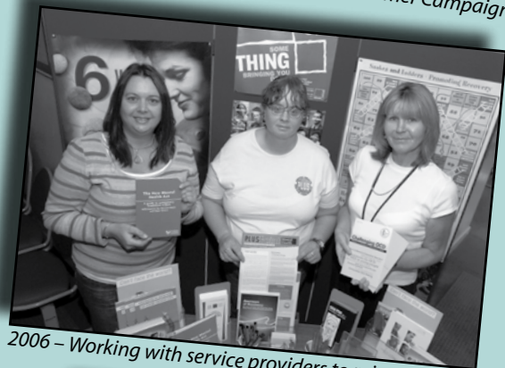
2006 – Working with service providers to raise awareness.