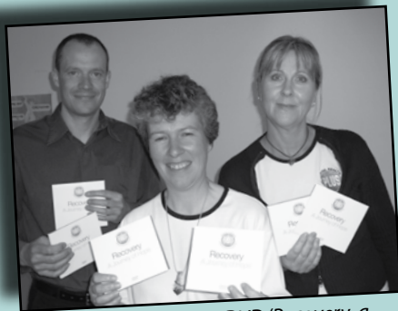
2005 – Launch of PLUS DVD 'Recovery, a Journey of Hope'.