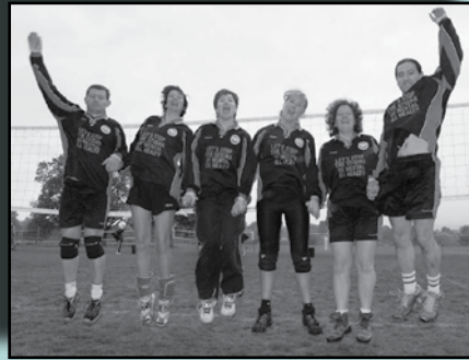
2003/2004 – Partnership formed with 'see me' and PLUS begins local anti-stigma campaigns.